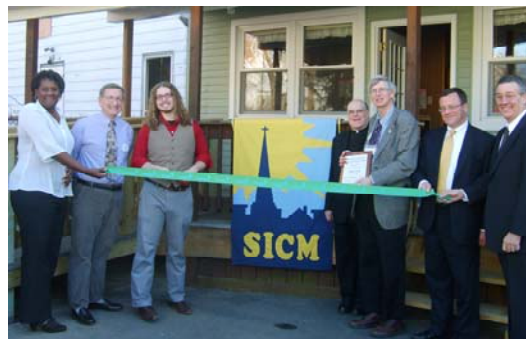
Damien Center Open House and Ribbon-Cutting Ceremony, March 16, 2010, coordinated by the Schenectady County Chamber of Commerce.

With our move to 615 Nott Street now complete, SDC staff and guests are looking forward to another exciting program year. We hope that our new home will allow us the space to host additional programs; encourage participation from new guests, volunteers, and AIDS service organizations; and provide us the opportunity to offer HIV/AIDS testing. Thanks to all the SICM churches that helped support SDC programs and guests in 2009. We look forward to seeing you at 615 Nott Street during 2010!