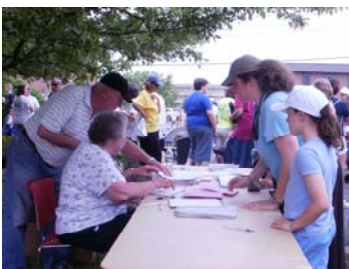
The registration table was a busy place!