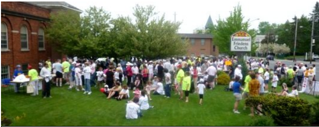
Assembling on the church lawn before the walk