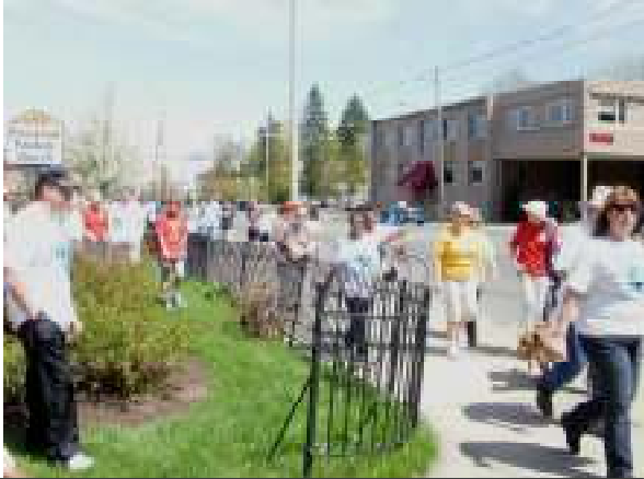
The walkers set out from Emmanuel Friedens Church, the starting point of the 2011 CROP Walk.

The Schenectady CROP Walk continued its long history of success in 2011. Over $44,000 was raised at the CROP Walk last May in Schenectady. The Walk stayed with the new route, with walkers starting from Emmanuel Friedens Church, walking through downtown Schenectady, past the Greenmarket, onto the Bike Path, around part of the Union College campus, and back to Emmanuel Friedens. Over 600 walkers participated this year, down slightly because Clifton Park churches planned a local fall event. Everyone was grateful for cooperation in the weather department!