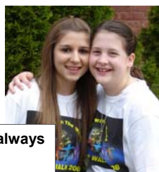
Walking with a friend is always double the fun!