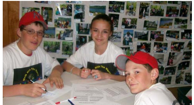
Young Letter Writers from EPUMC's Jr. High Youth Group