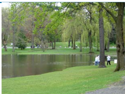
This year's CROPWalk was "A walk in the park!"