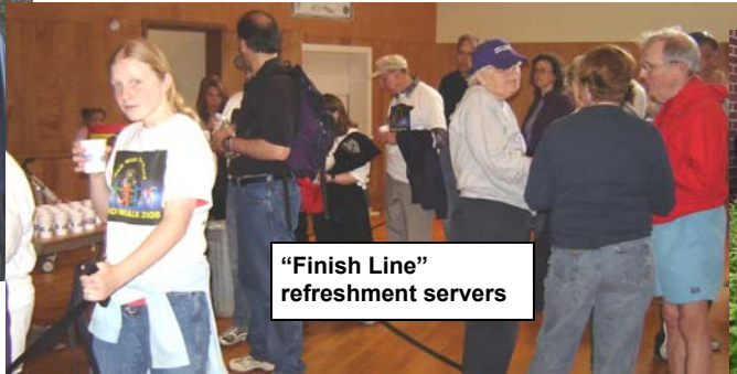
"Finish Line" refreshment servers