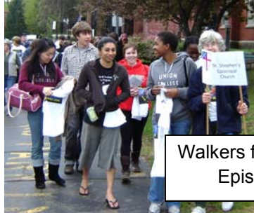
Walkers from St. Stephen's Episcopal Church