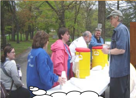
Central Park "Water Stop" Crew