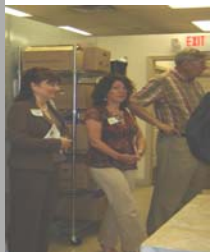
Schenectady Chamber of Commerce staff members partake in a tour of the Pantry!